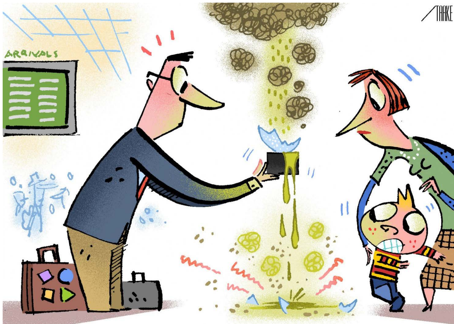
From a Beijing gift shop: An acid-rain globe. (Bob Staake for The Washington Post )