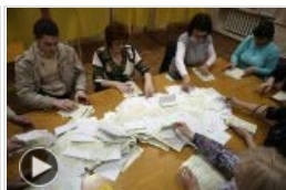
Polls close in Crimea