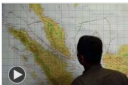
Satellite firm enlists public help to find jet