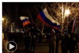
Scenes from Sevastopol, Ukraine