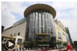
Thailand mall is most photographed on Instagram