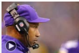
NFL Black Monday sees five coaches fired