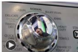
The future of smart and connected homes