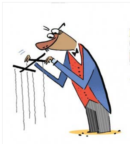
For Week 1010, cartoon captions: A rare public appearance by the least popular Doody sibling, Hidey.