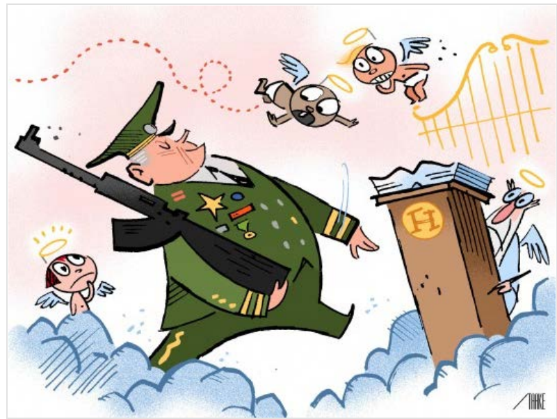
The late Mikhail Kalashnikov.