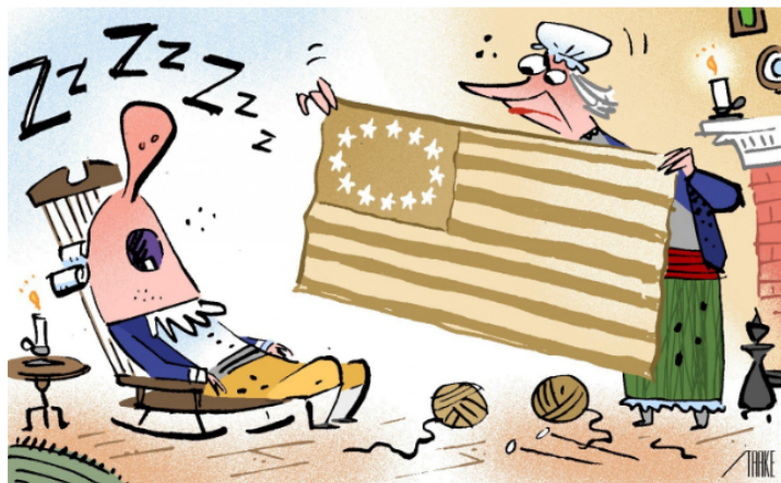
The Goodhue-Bland Resolution to make the new flag colors ecru and taupe. (Bob Staake /For The Washington Post)

By Pat Myers , Style Invitational editor July 3, 2013