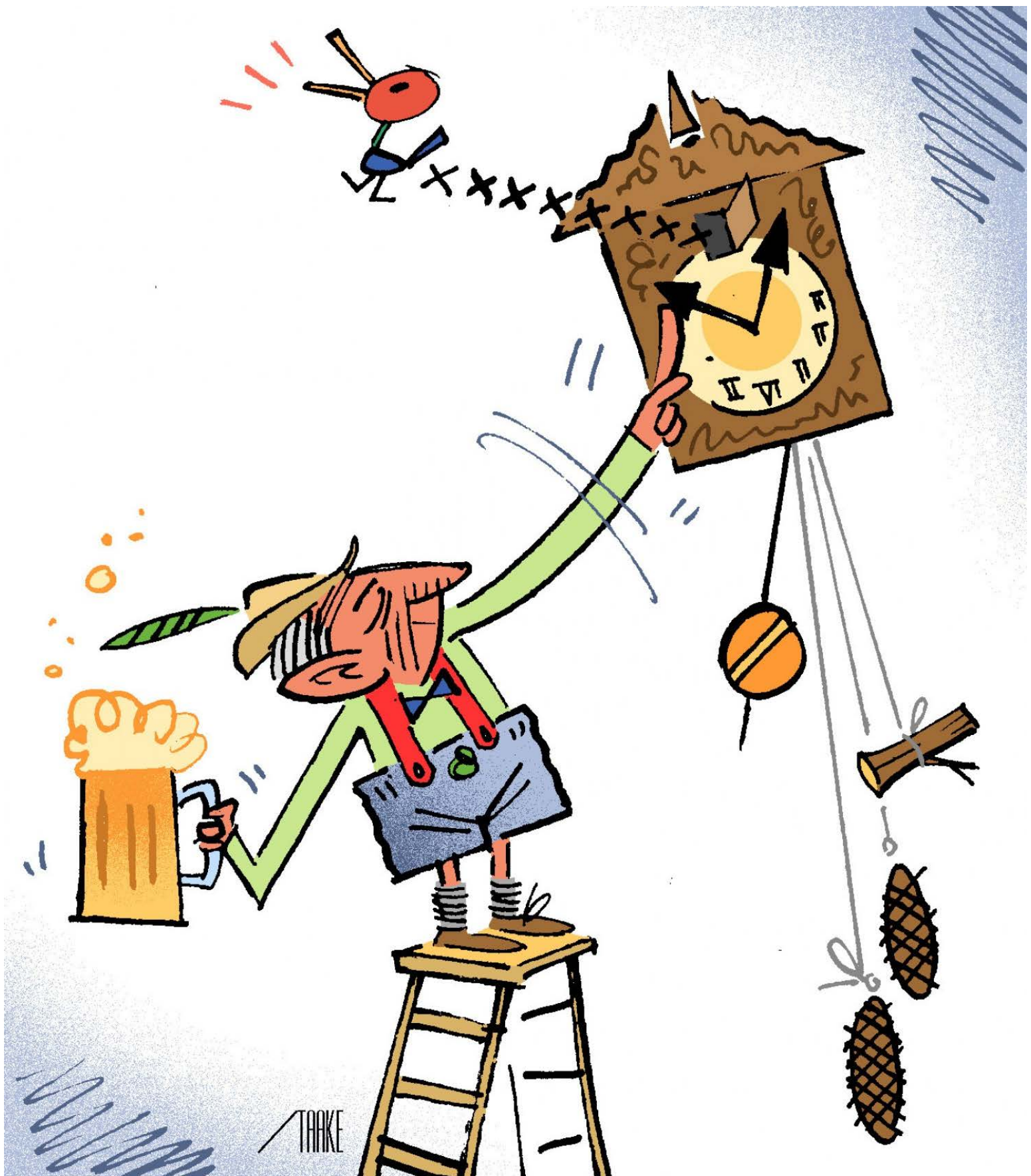
Who was postwar Germany's great champion of daylight-saving time? Adenauer!