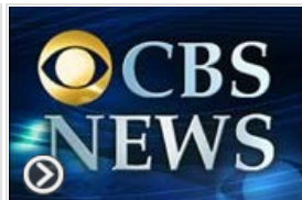
Rand Paul slams "stale and moss-covered" Republican old guard