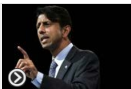
Bobby Jindal: GOP must 'recalibrate the compass of conservatism'