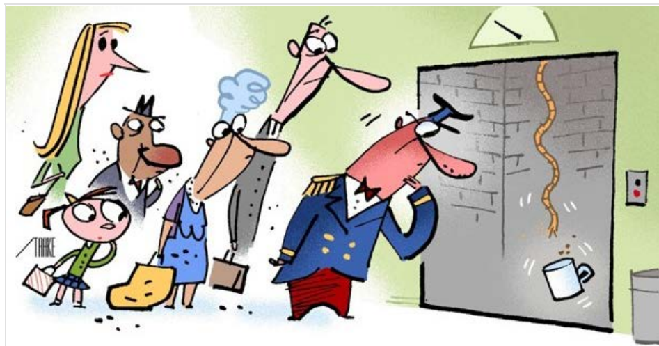
Bob Staake for The Washington Post - Otis Elevators: Good to the last drop.