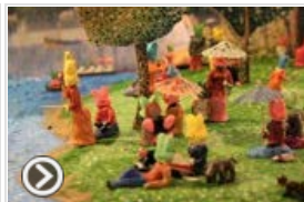
A Sunday Afternoon on the Island of La Grande Peep