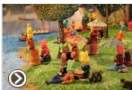
A Sunday Afternoon on the Island of La Grande Peep