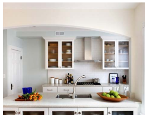
The kitchen of 2013: Experts dish