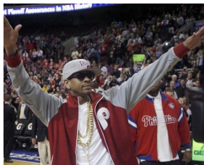
Allen Iverson, NBA icon, struggles with life after basketball