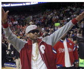
Allen Iverson, NBA icon, struggles with life after basketball