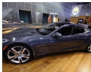
Five myths about electric cars