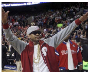
Allen Iverson, NBA icon, struggles with life after basketball