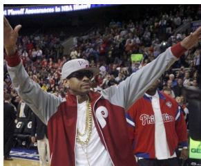
Allen Iverson, NBA icon, struggles with life after basketball