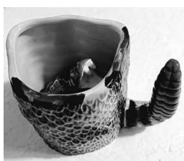
You have to drink only a few sips of coffee before this week's prize wakes you up good.

● The Style Conversational: The Empress's online column returns in a couple of weeks.