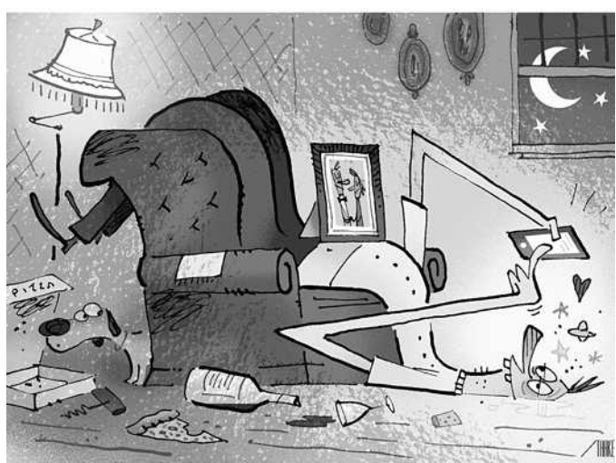
BOB STAAKE FOR THE WASHINGTON POST

The new Duchess of Sussex and the print Post : You won't find either