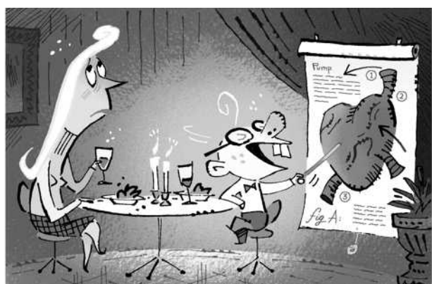
BOB STAAKE FOR THE WASHINGTON POST