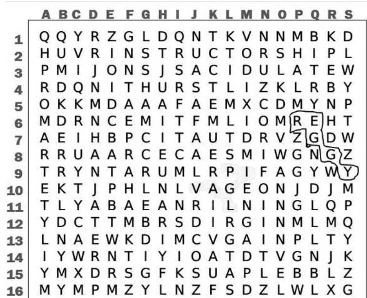
GRID CONSTRUCTED AT PUZZLE.MAKER.COM

Still running — deadline Monday night, March 27: Our contest for “lik the bred” poems. See bit.ly/invite1219.