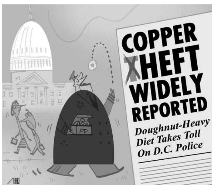
BOB STAAKE FOR THE WASHINGTON POST

A mourning wear boutique: Don't Stop Bereavin' (Kevin Dopart, Washington)