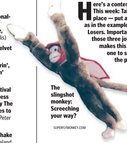
The slingshot monkey: Screaming your way?