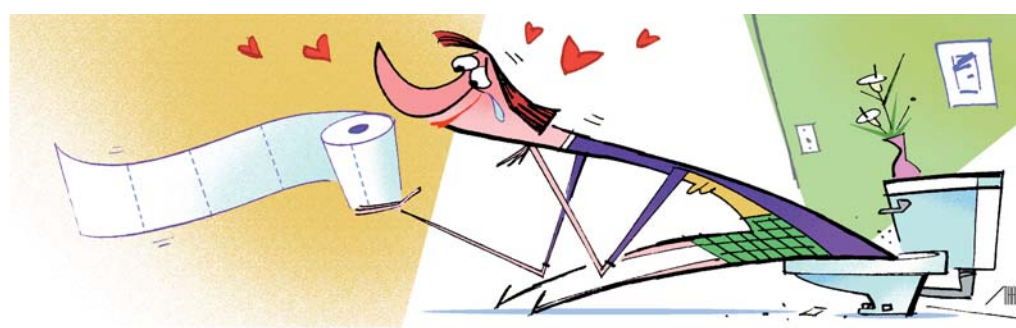
ILLUSTRATIONS BY BOB STAAKE FOR THE WASHINGTON POST

"On reflection, Angela perceived that her relationship with Tom had always been rocky, not quite a roller-coaster ride but more like when the toilet-paper roll gets a little squashed so it hangs crooked and every time you pull some off you can hear the rest going bumpity-bumpity in its holder until you go nuts and push it back into shape, a degree of annoyance that Angela had now almost attained."