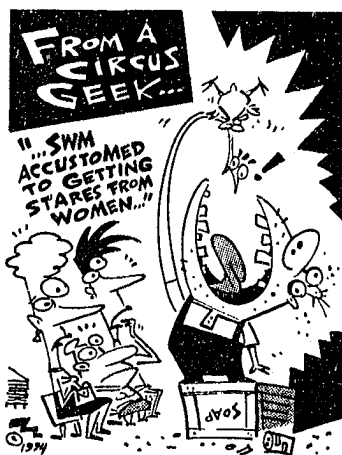
BY BOB STAAKE FOR THE WASHINGTON POST

From a bulimic: "...Easy to please, enjoys pretty much whatever comes up..."