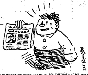
ILLUSTRATION BY MARC ROSENTHAL FOR THE WASHINGTON POST

SPIC AND SPAN BANNED FROM GROCERY SHELVES